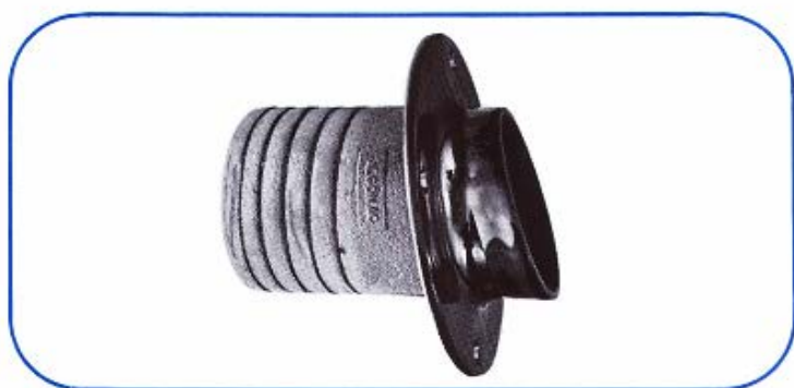
Exhaust Tube (Available in other degrees)