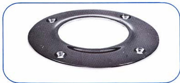
Exhaust Trim Flange