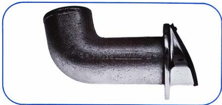
Exhaust Tube With 90° Hose Barb